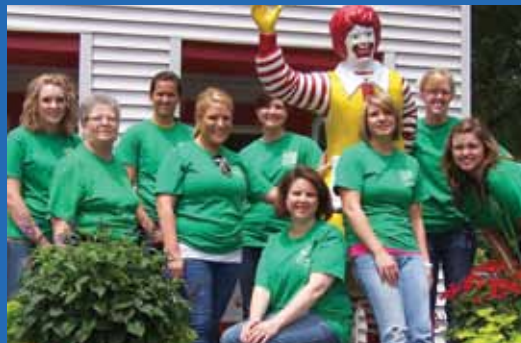
Enterprise Car Rental