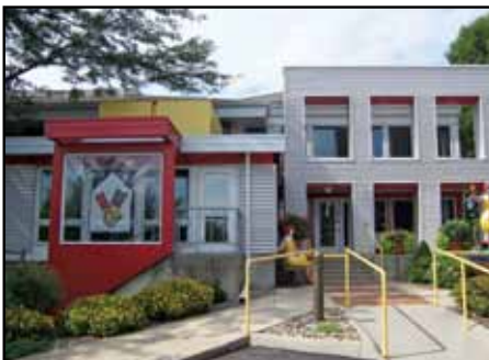
The House today

It's been a long journey and the House has undergone many changes. But our mission has always stayed the same. We continue to offer families the refuge, comfort and consistency they need when their life has been turned upside down. Our families have humbled the staff and volunteers at the House. Their struggles, their perseverance and their joy have been truly remarkable. Our families are also an incredible support for each other; they eat together, cry together and listen to each other, while forging life-long friendships. Because of supporters like you, the Ronald McDonald House will be open tomorrow to sustain that possibility.