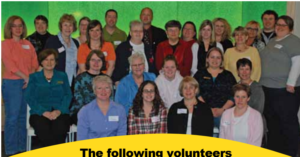
The 2011 Volunteer Awards Dinner attendees. This year's dinner took place at Big City Burgers and Greens in Downtown Des Moines.

We truly appreciate our MANY DEDICATED VOLUNTEERS. From our relief help, to meal providers, groups that help clean and do yard work to our board of directors. It is their dedication, enthusiasm and the true meaning of giving back that help us make this the "The House That Love Built."