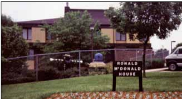
The House as it looked in 1981 when it first opened

For the past 30 years we have provided comfort and support to families with children facing serious illness or injury. The House serves approximately 300 families per year from communities throughout Central Iowa, as well as the surrounding region. Our families are from all walks of life, seeking critical medical care for their children that is not available in their home communities.