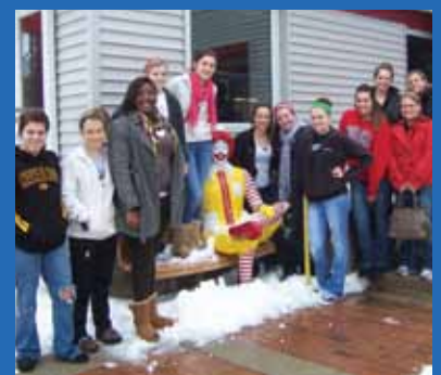
Gear Up Des Moines