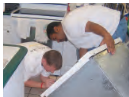
"Positioning Yourself for Success" group from Nationwide Insurance: