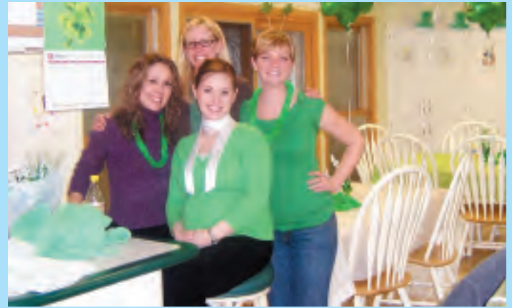
Volunteers from ProStaff prepare a St. Patrick's Day dinner.