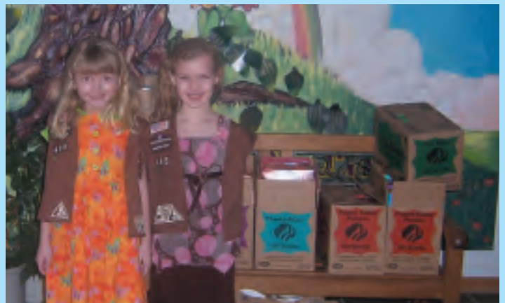
Girl Scout Troop #495 from Allerton, Iowa delivered Girl Scout Cookies to the House.