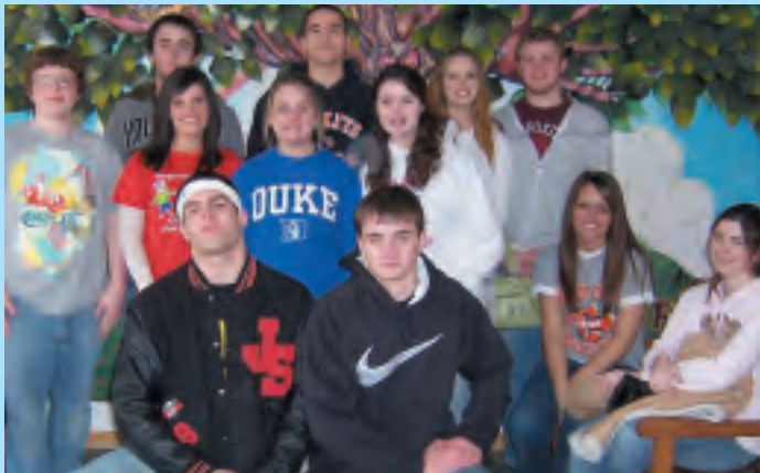
The Payton Churdan National Honor Society spent several hours at the House baking and cleaning.