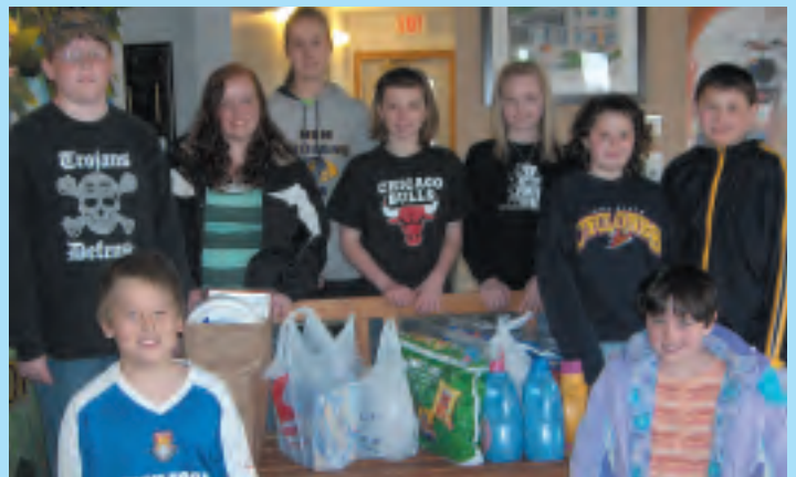
The WHH 4-H Club from Williams, Iowa volunteered by cleaning and cooking at the House. The kids enjoyed their day helping others.