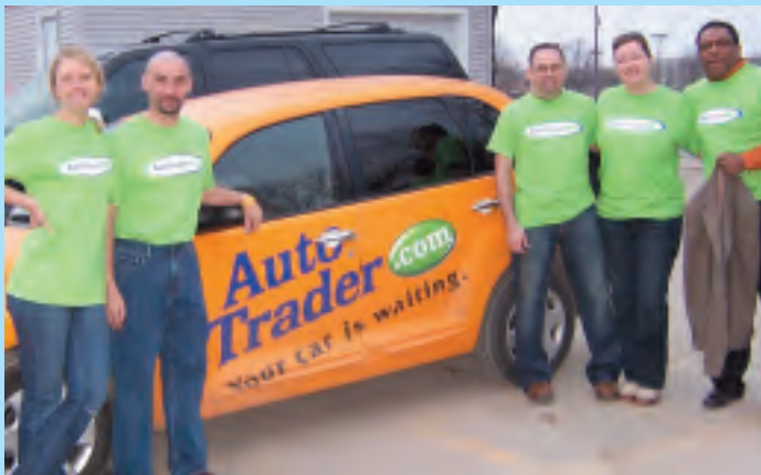
Autotrader.com regularly prepares meals for the families at the Ronald McDonald House. They also volunteered at this year's Run for Ronald event, and added to the festivities by providing a large inflatable gorilla!